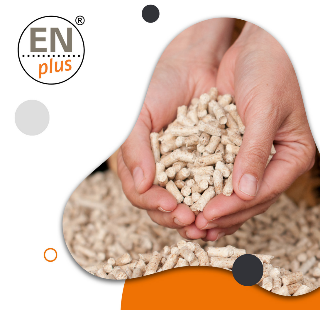
TIPS & RECOMMENDATIONS FOR PELLET CONSUMERS