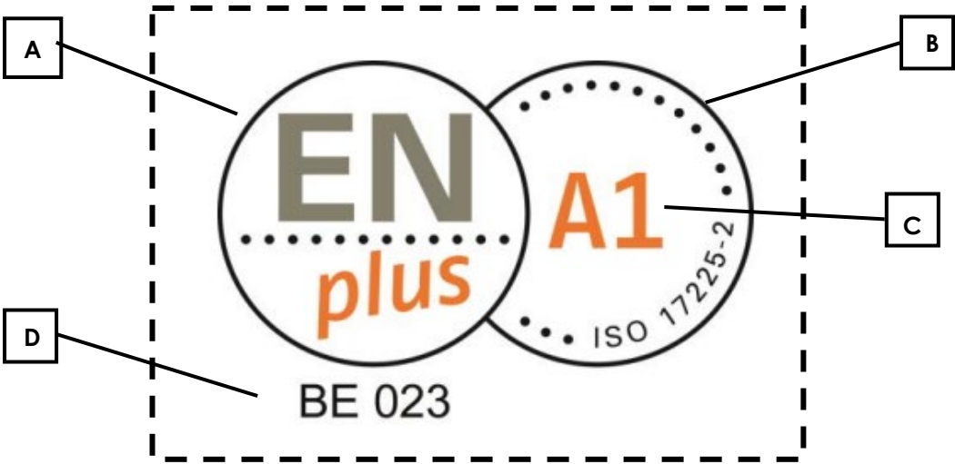
Elements of the ENplus® quality seal